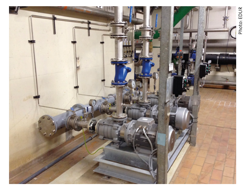
Fig. 6: Municipal waste water treatment plant Bülk, Germany

Many municipal waste water treatment systems worldwide have been retrofitting to the new multiphase system (Fig. 7). All users report of similar savings.