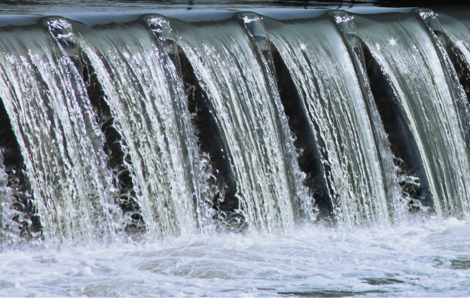
A large market segment is the water and waste water treatment by means of dissolved air flotation where the multiphase pumps provide the task of air saturation without the use of compressed air.