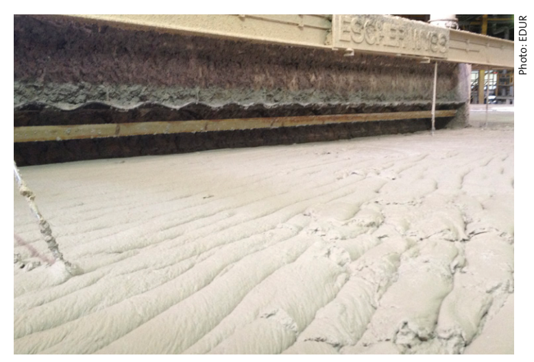
Fig. 5: Flotate

channels to the Bülk waste water treatment plant where it is treated and finally pumped into the Baltic Sea .